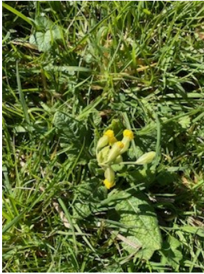
Cowslip ( Primula veris )

The seeds are spread by ants. They are mostly in bud at the moment, but within the next week or so, it is well worth going to have a look.